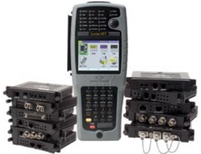
SunSet MTT (Modular Test Toolkit)- with support for over 30 test modules- is the industry standard for DSL and access testing.

Sunrise Telecom is a leading provider of service verification equipment for telecommunications, cable broadband / TV, and Internet networks. Sunrise products offer broad functionality, leading-edge technology, and compact size to enable service providers to pre-qualify lines for services, verify newly installed services and diagnose problems relating to wire line access services (including digital subscriber line, DSL services), fiber optics, cable broadband networks and signaling networks. Customers include companies such as Comcast, Bell South, France Telecom, Korea Telecom, SBC, and Verizon. Sunrise is benefiting from the demand for high-speed broadband Internet access. Service providers encounter several major challenges in deploying reliable high-speed broadband Internet services. These challenges are caused by physical impairments to either the cable TV line or the traditional phone line including shorts, opens, power crosses, wet cables, load coils, and bridge taps. These impairments can weaken or even prevent service from being delivered. Sunrise Telecom's leading-edge products accelerate service providers' ability to identify and fix these problems, and ensure that proper service is delivered.